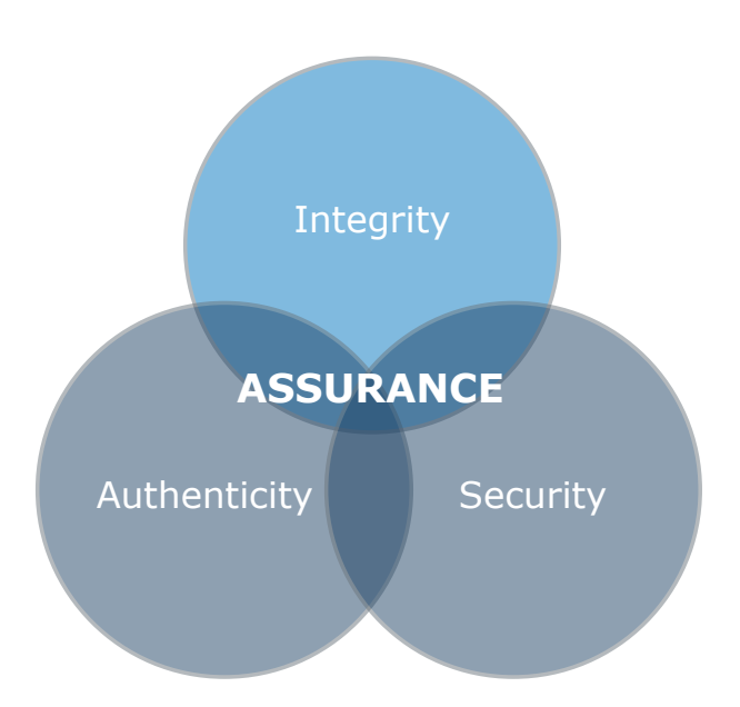
Figure 1: The three elements of software assurance

While the delivery of secure software products requires that all three elements of software assurance be addressed, the focus of this paper is on software integrity practices - the collection of processes and controls that enable a supplier to deliver a product to customers that is uncompromised, thereby containing only what the supplier intends. Software integrity practices address the security of the processes used to handle software components during their sourcing, development and delivery. In this way, they differ from (and complement) secure development practices that improve the security characteristics of the code comprising the software components. Software integrity practices are essential to minimizing the risk of software tampering in the global supply chain.