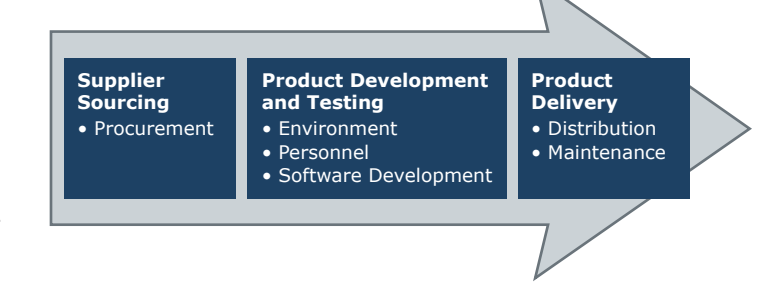
Figure 2: Each supplier in the software supply chain manages three sets of controls

Now consider that delivered software is just one component of a larger IT solution and each software supplier is only one vendor in a complex chain of suppliers and systems integrators. Customer relationships extend even beyond the traditional system integrators since some "acquirers" implement systems as solutions for other end users. As such, the software supply chain is only one part of a larger, more complex IT solution supply chain.